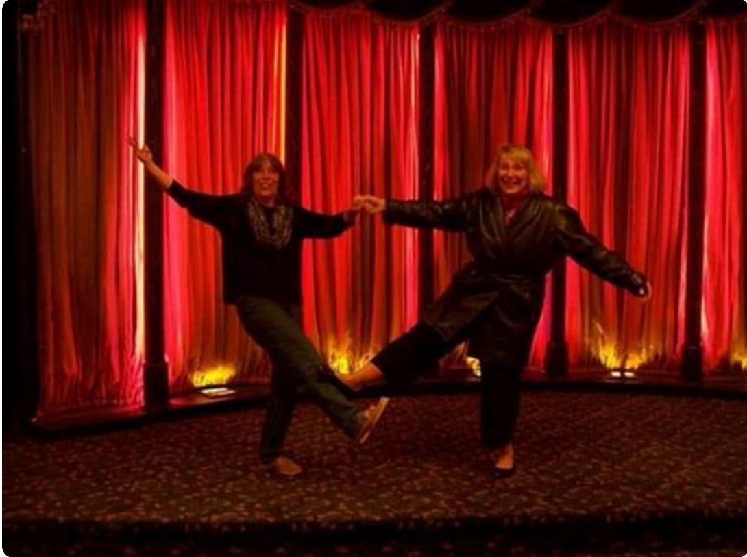
We were the Rockettes!